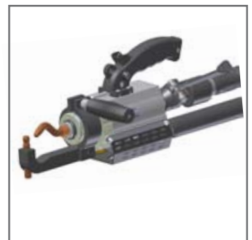
Feder edge kit