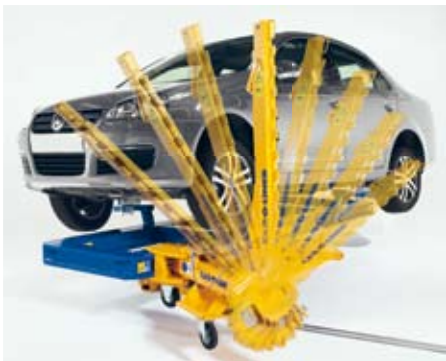
Powerful 10-ton Draw-Aligners pull from almost any angle 360° around the vehicle.