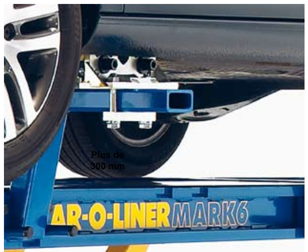
Longer bench arms allow maximum work space between bench and underside of vehicle.