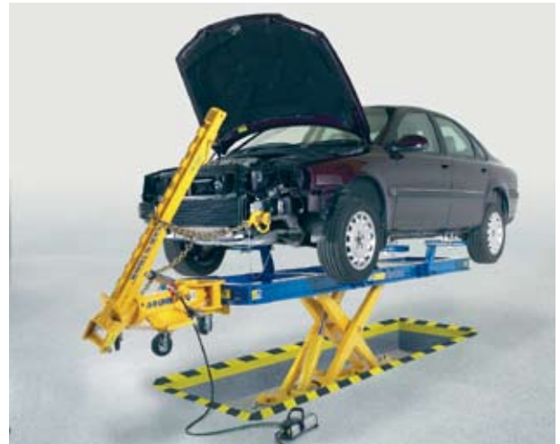
Inground installation leaves frame level with floor allowing for easy drive-over and clean shop appearance.