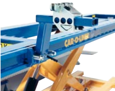
Optional chassis clamp (B110) offers faster setup and removal using just two bolts.