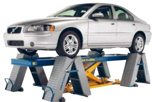
Approach ramps that easily can be converted into wheel stands, that gives excellent working conditions.